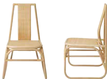
MR side chair MC-02 NA W530×D510×H870 (SH430) ¥54,000 material : Rattan col. : Natural