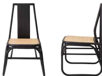
MR side chair MC-02 BL W530×D510×H870 (SH430) ¥54,000 material : Rattan col. : Black