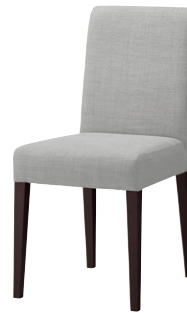
張地 シルキーラスタルⅡ UP5235 (B)