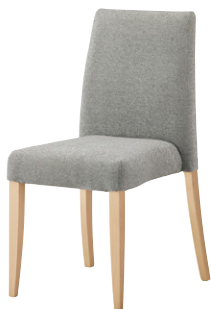
張地 ノルディウォームⅡ AC UP5598 (E)