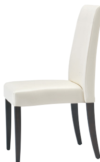
張地 アイコン ICO-1 (A)