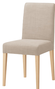
張地 シルキーラスタルⅡ UP5243 (B)