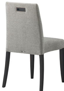
張地 ノルディウォームⅡ AC UP5598 (E)